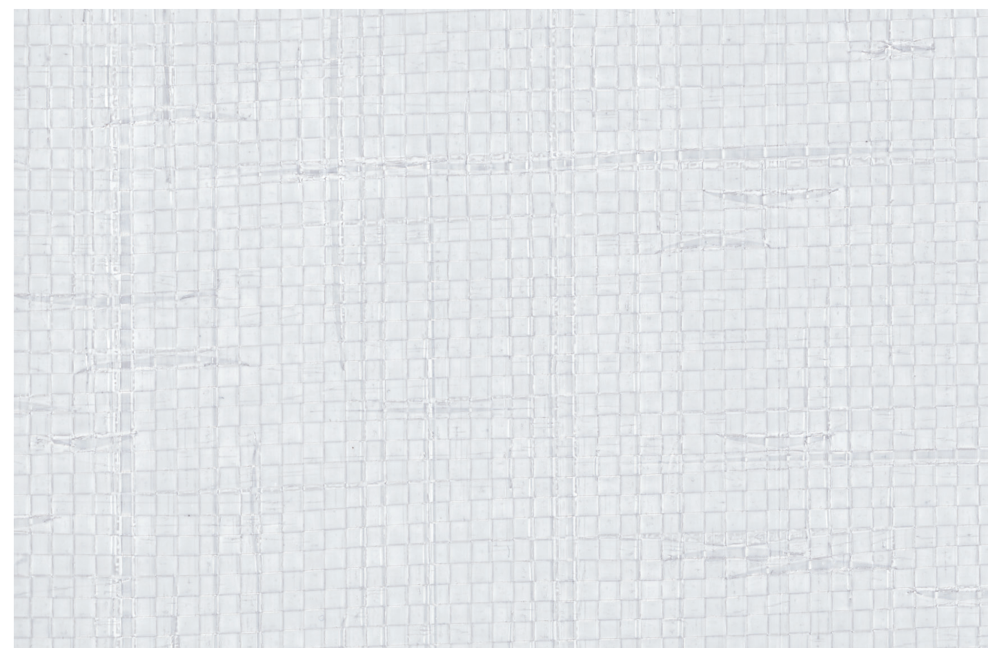
White 413118 | 413132 ^ | 413187